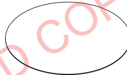
SCALE 2 : 1